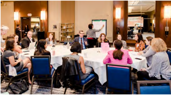
"Innovating to Inspire Healthy Eating Practices Through a Social/Cultural Lens" breakout group discussion.